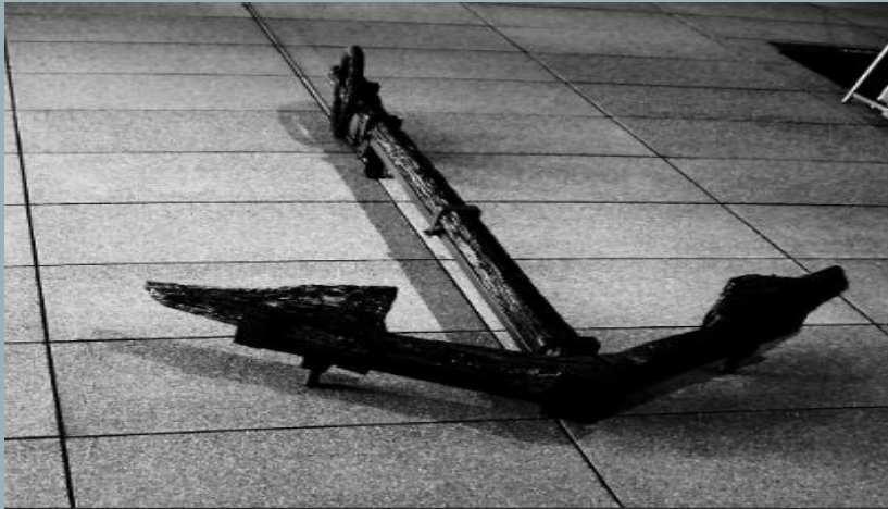
Te Papa Museum