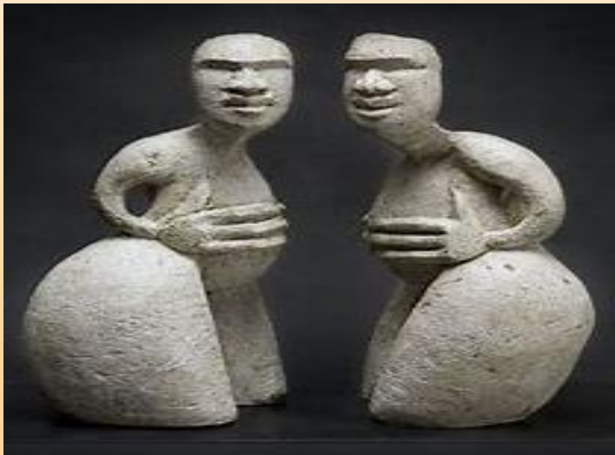
Artist: Paerau Corneal